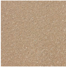
1107 | Latte