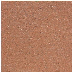
1105 | Ginger