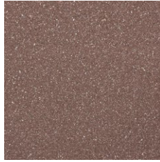
1103 | Cinnamon