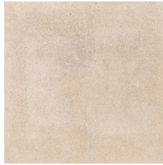
1109 | Yellow *