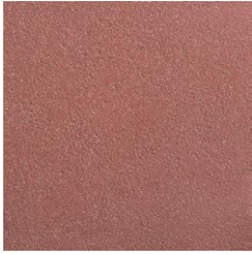
1102 | Red