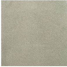
1101 | Natural