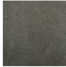
1104 | Charcoal